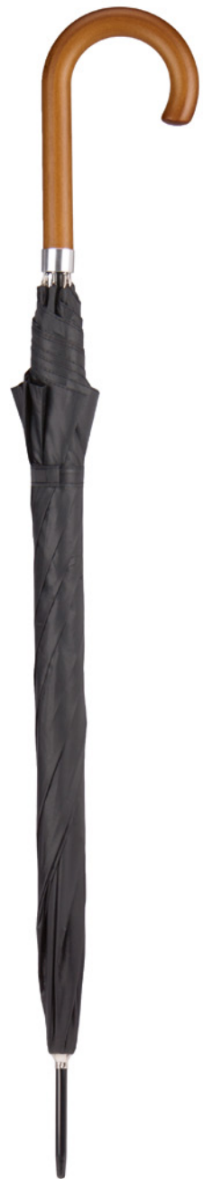
467N 61cm x 8 Auto.