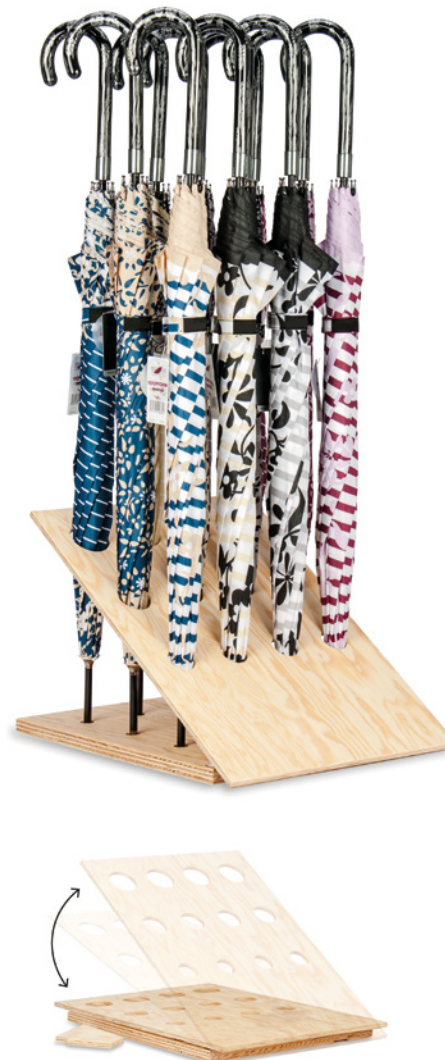
ref. 593618 Expositor FLAT-PACK (envío plano) para 12 paraguas largos