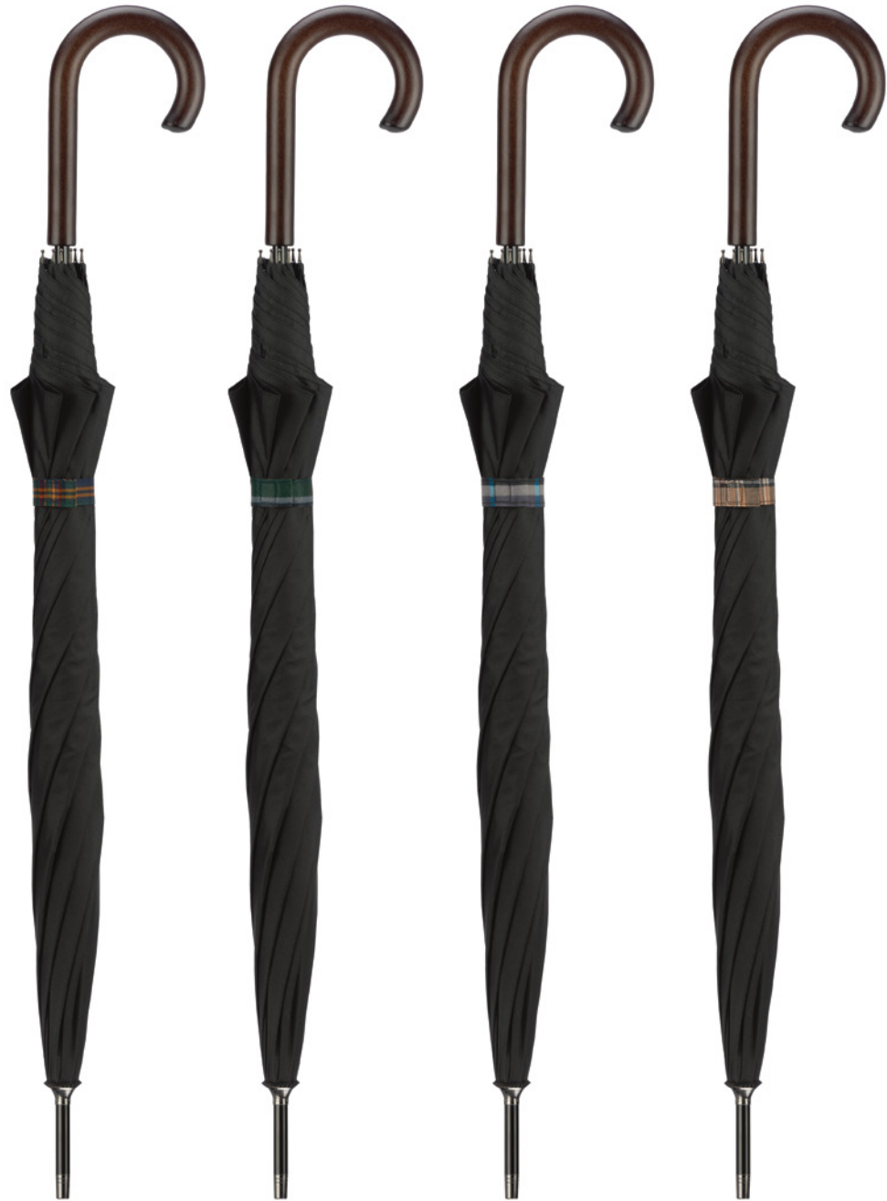
1500 65cm x 8 - Auto.