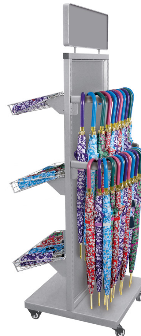
593651 Expositor metálico con cuatro ruedas para 80-90 paraguas