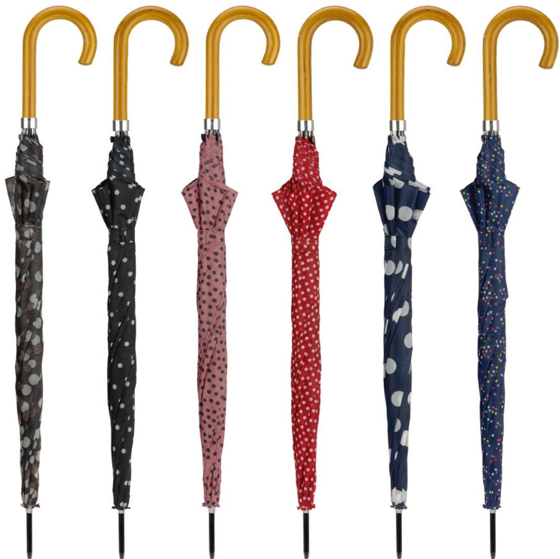
468 61cm x 8 - Auto.