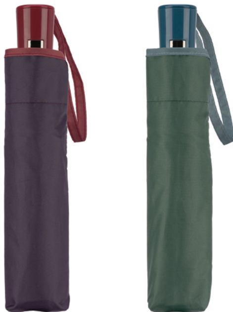
5672 53cm x 7 - 3sec. Auto.