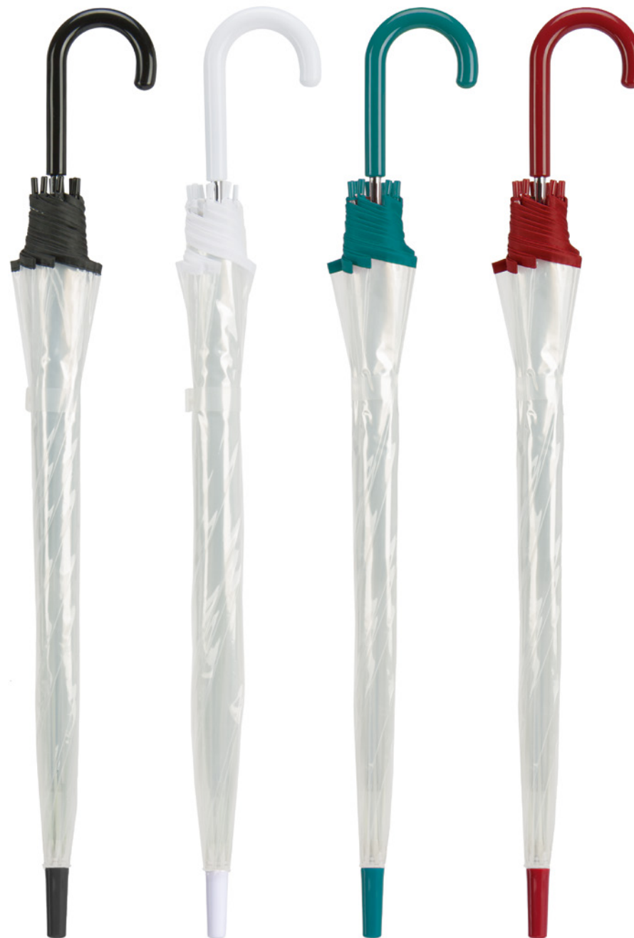
4035 61cm x 8 - Auto.