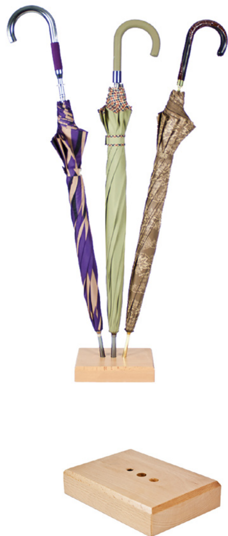
ref. 593614 Expositor de madera para 3 paraguas largos