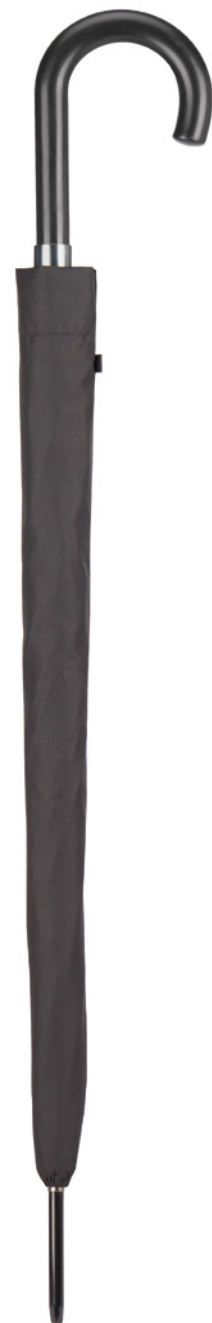
1091 61cm x 8 Auto.