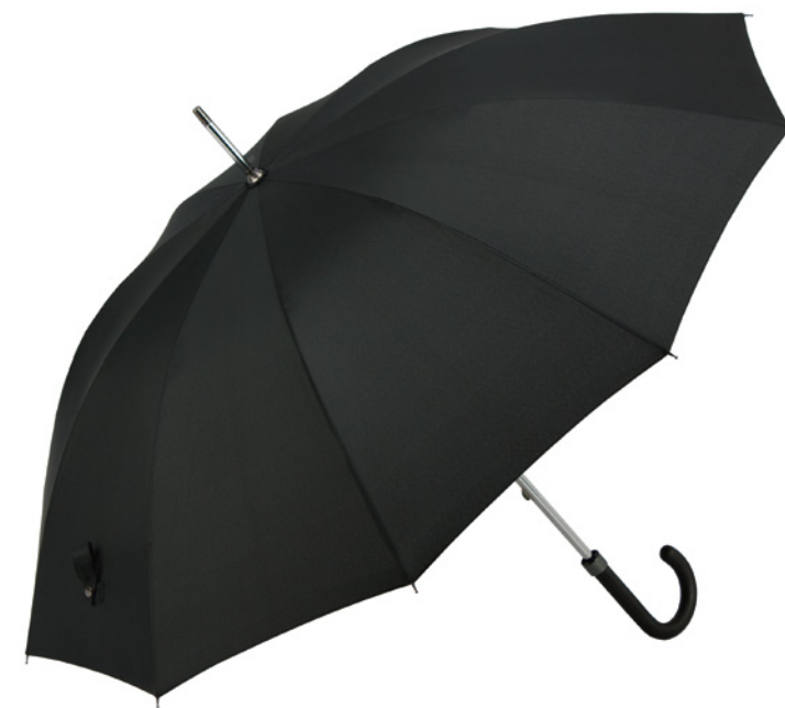
115 63cm x 10 "Chanteiro"