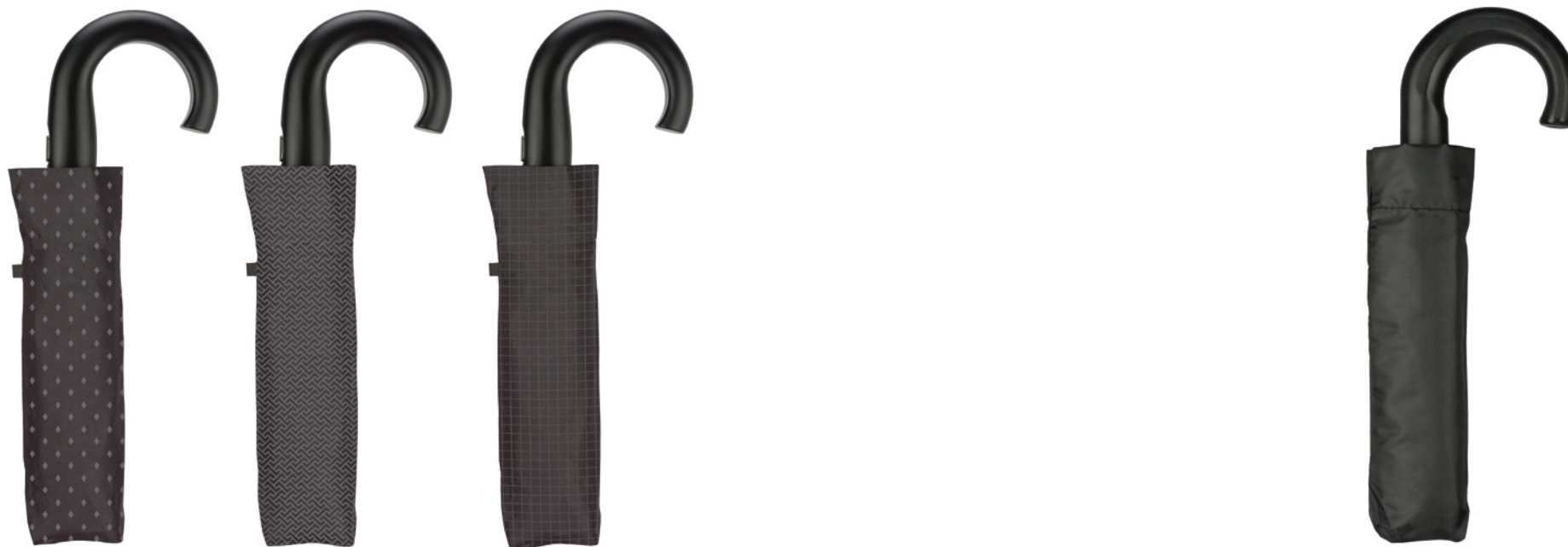
3381 54cm x 8 - 3sec. Auto.