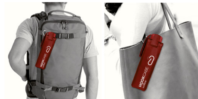
5582 54cm x 8 - 3sec. ALU