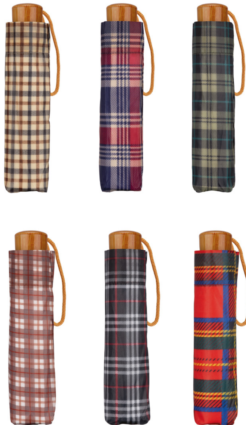
502S 54cm x 8 - 3sec.