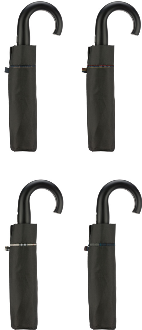
3371 54cm x 8 - 3sec. Auto.