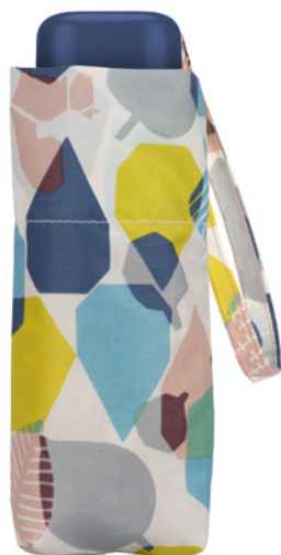
5583 52cm x 6 - 5sec. ALU