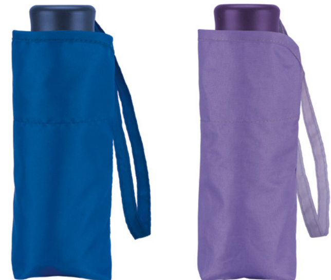
5755 52cm x 7 - 5sec.