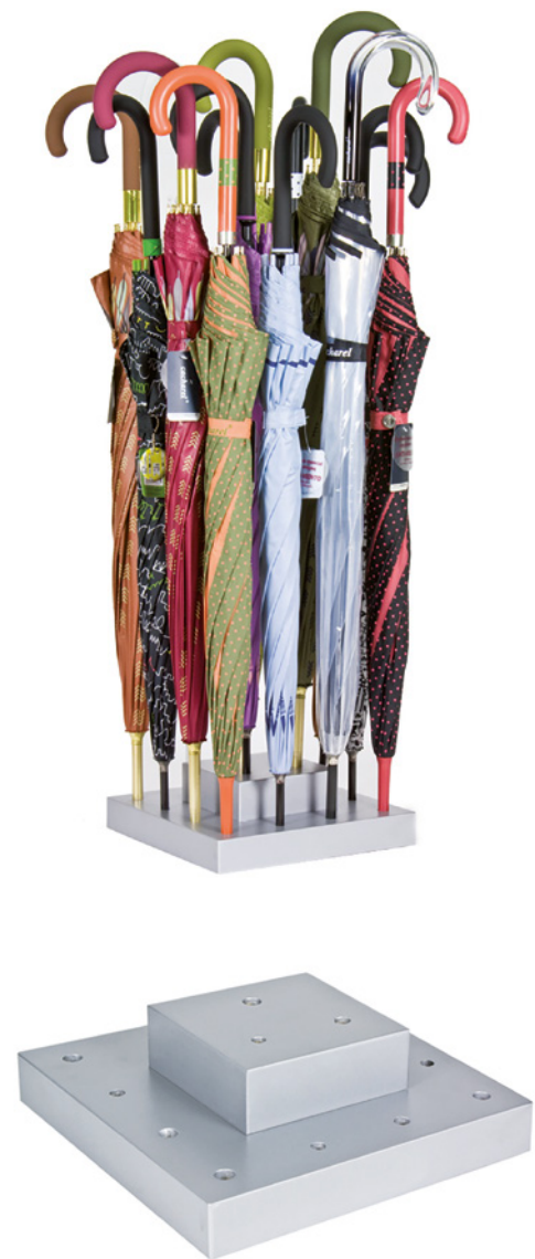
ref. 593628 Expositor de madera plateado para 15 paraguas largos